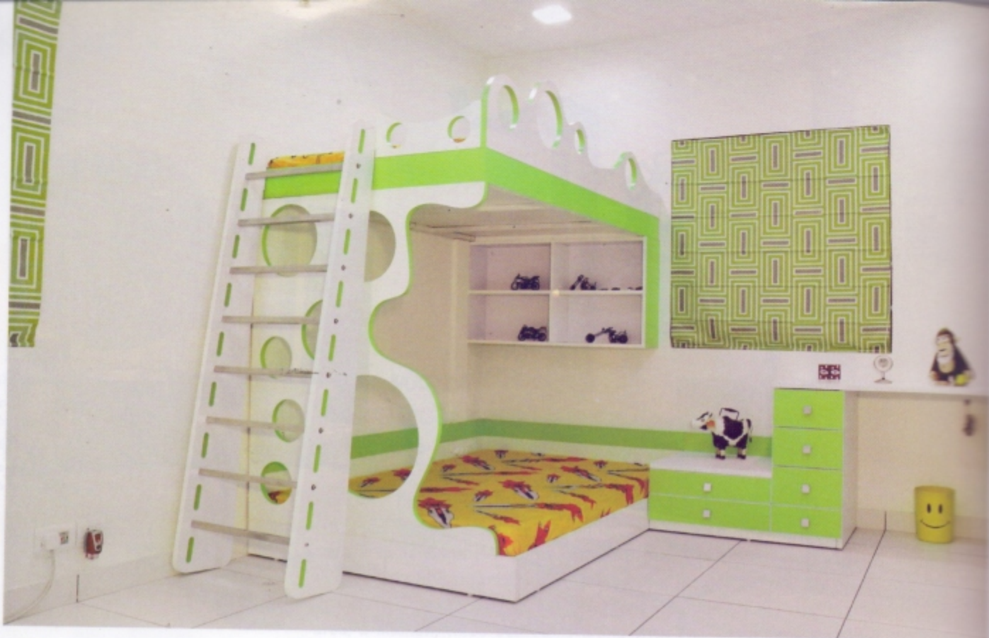
ABOVE: The son's room is done in a vibrant green and white colour scheme.